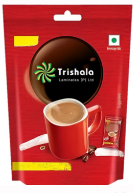
Tea & Coffee