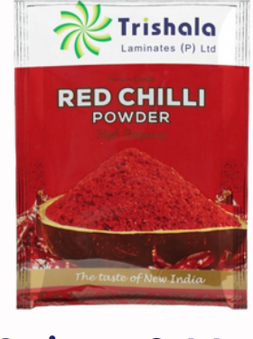
Spices & Masala